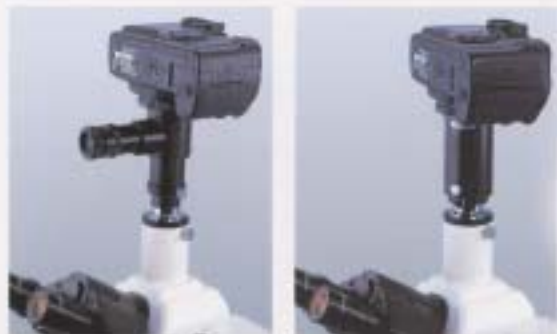
MA150/60 Camera attachment MA150/50 Camera attachment

These attachments are used to mount the camera with T2 adapter ring to the photo tube.