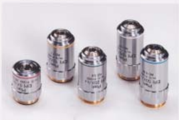
PLAN EPI OBJECTIVES