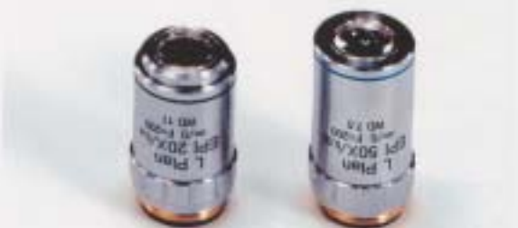
LWD (LONG WORKING DISTANCE) PLAN EPI OBJECTIVES