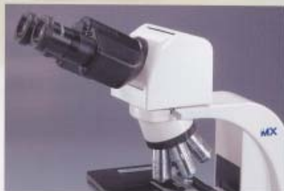
MA957 ERGONOMIC TILTING BINOCULAR HEAD (SIEDENTOPF TYPE)