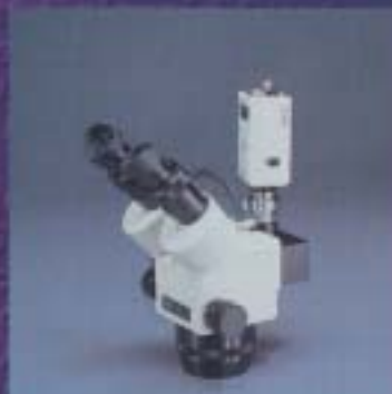
EMZ-12TR with SWF10X, MA151/8TR and CK3900