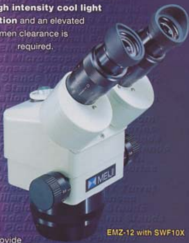
EMZ-12 with SWF10X