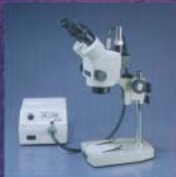
EMZ-12TR with SWF10X, PX stand, FL150 and FL150/12