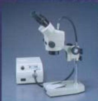
EMZ-12 with SWF10X, PX stand, FL150 and FL150/12