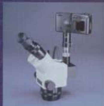
EMZ-12TR with SWF10X, MA151/35/50 and NIKON Coolpix 950